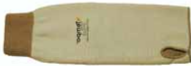
Sleeves Tempflex Nomex III. Length 18"